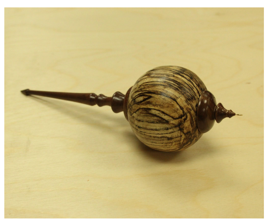
Tim Snow shows a turned ornament and a unique wine bottle stand..