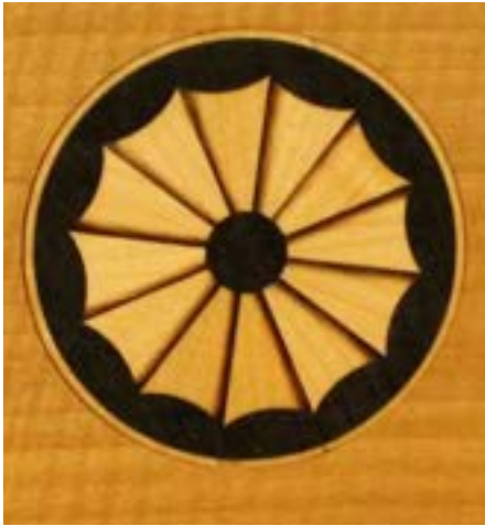
Lidded keepsake box by Barney Travis with intricate inlays. Various woods.