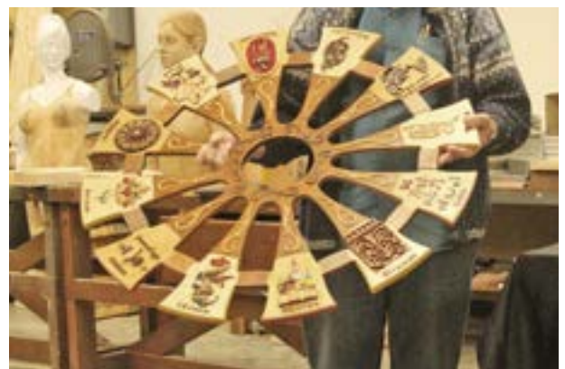
Jerry Spady with a multi spoked wheel. Each spoke of the wheel represents a different culture or civilization. Fine-ply construction.