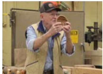
Jigs to hold multiple pieces for finishing and using acrylic in wood turning.