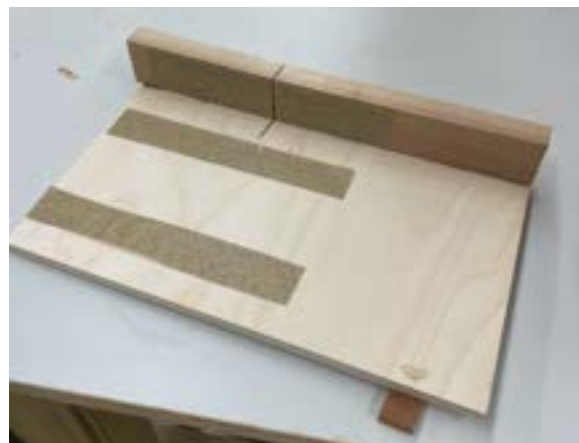
Jig for sawing dovetail tails on the bandsaw.