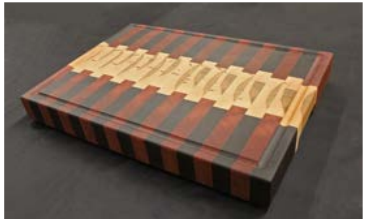
Patterned cutting board of various woods, by Angelo Bellucci.