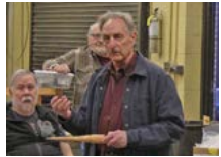
Tapered reamer for making tapered mortises for chair legs.