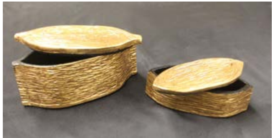
Bandsawn box made after demonstration from last meeting.