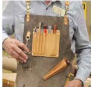
Custom made tool apron which puts everything right where it is supposed to be.