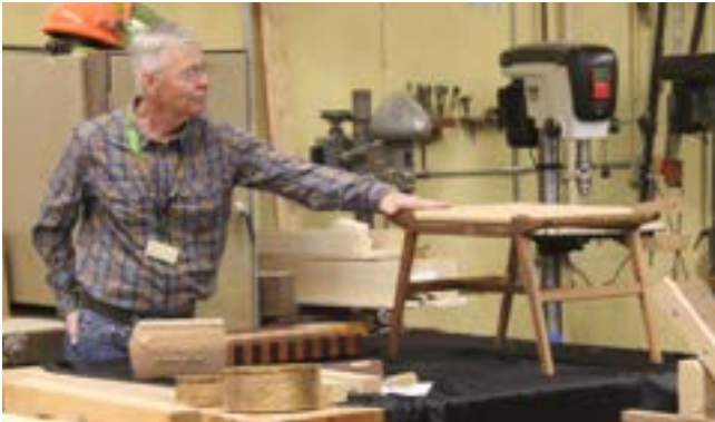
Stool/bench with woven seat by Mike Casey.