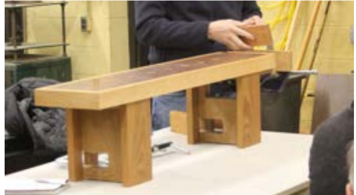
Bench top bench to elevate working height for some task specific that requires a higher bench top, also being portable is a feature, by Stephen Paddison.