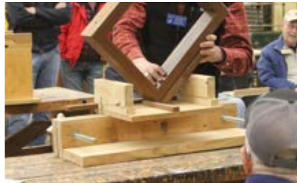
Jig for cutting splines in a mitered frame.