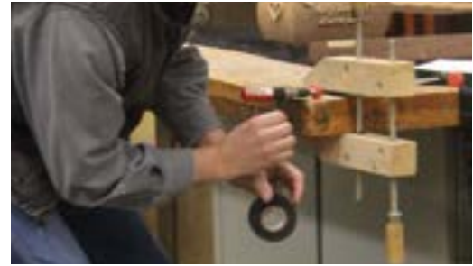
Technique for wrapping tool handles to provide more comfortable grip.