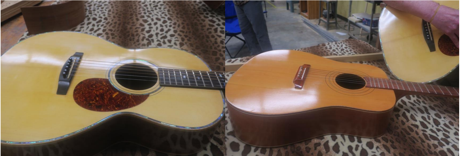
Two examples of Dolan guitars