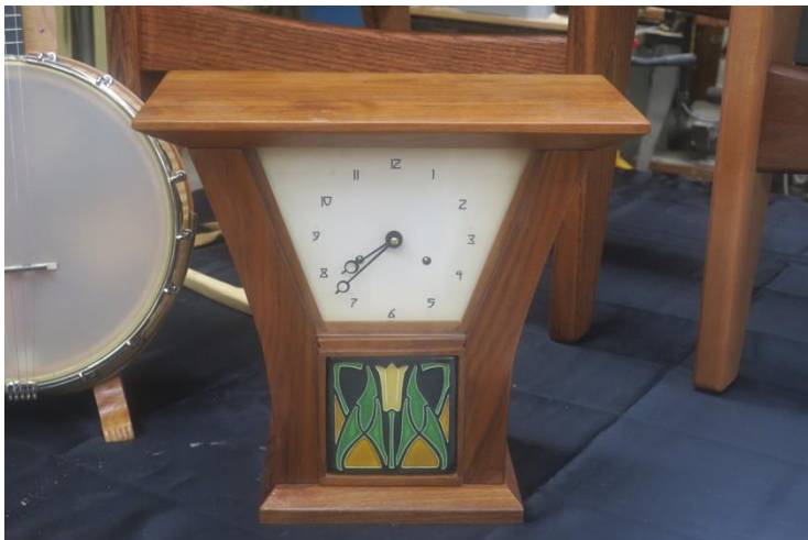
Art Deco Clock made of walnut with stained glass made by Jim Yugo