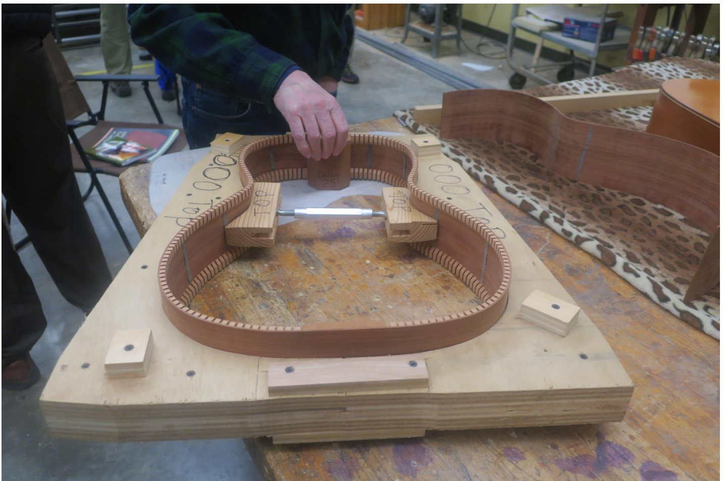
Guitar body in process with kerfing