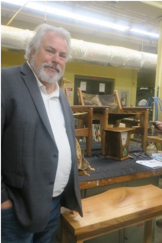
Drop Table made of oak by Phil Guthe