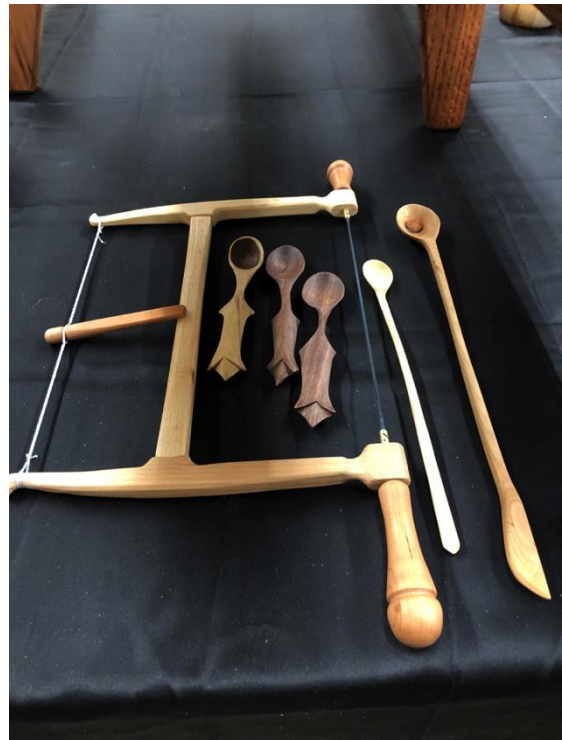
Bow Saw made of ash and cherry and wooden spoons of maple, ash and walnut by Tom Ehrnschwender