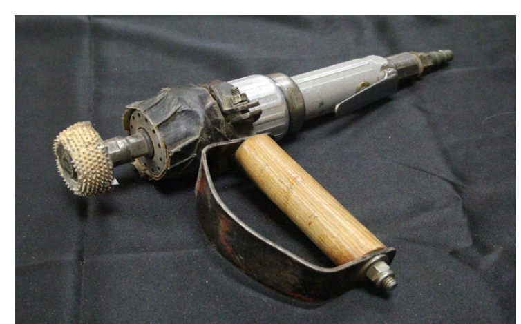
Various tools, note modified handles with knuckle guard.