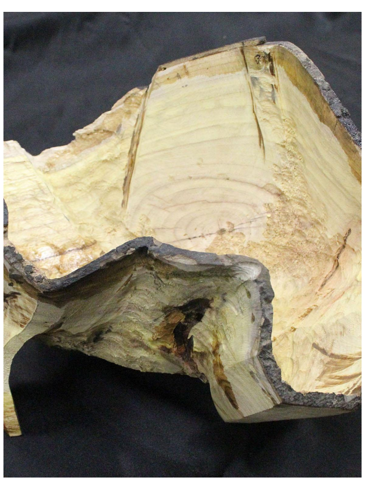
More pieces that Brad brought to share, various woods and some dyes used to enhance color, mostly on the sapwood.