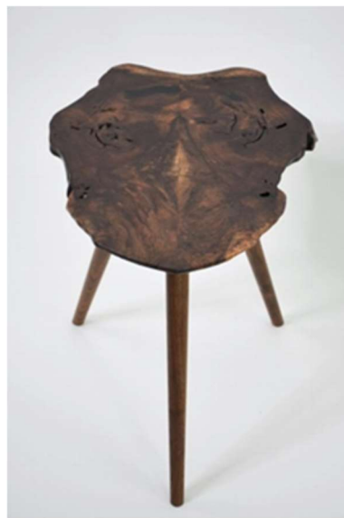
Arrowhead Side Table

Cherry finished with satin wiping varnish