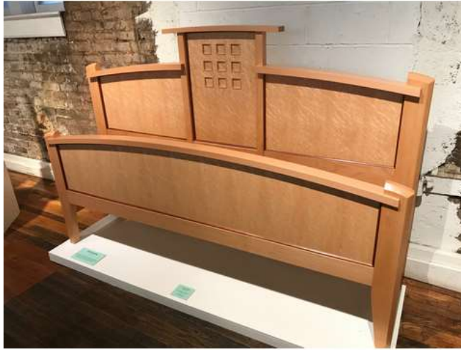
Barrett Bed Frame

I am a full-time studio furniture maker working primarily on a commission basis. My work resides in area churches, businesses, and homes. I am also the Director/dictator for the Master Woodworkers' Show.