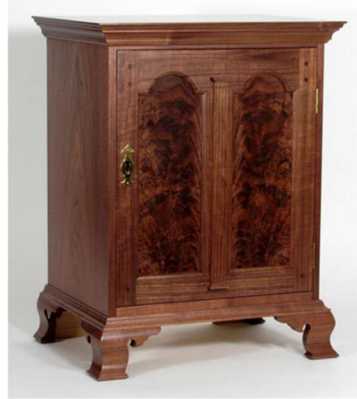
Walnut Spice Box

Curly Maple top with inlaid 1/8" wood tiles.