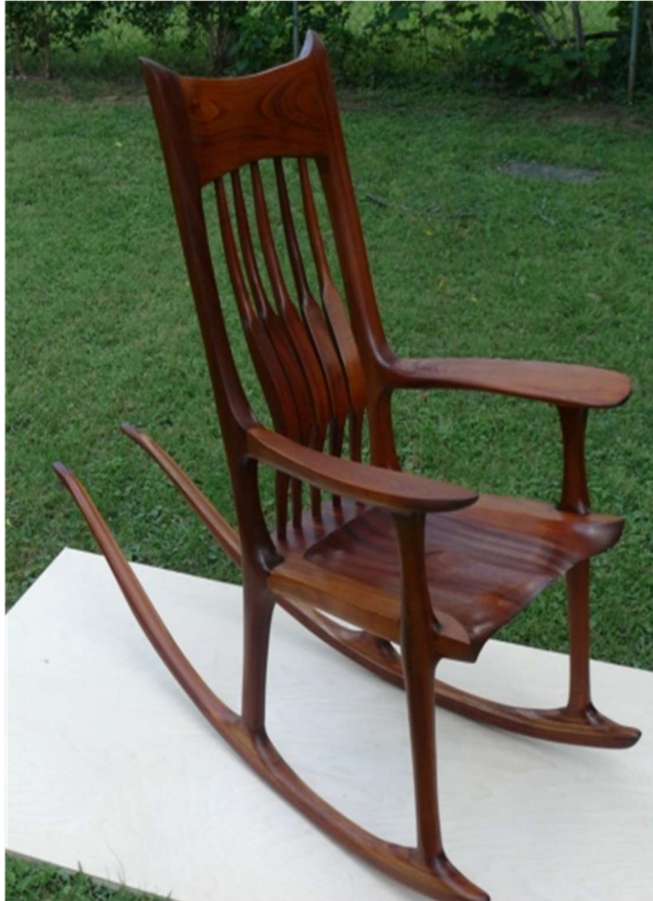
Sculpted Rocking Chair

I have been woodworking for 25+ years. I studied at Marc Adams School of Woodworking and received a master woodworker certificate from there. I enjoy doing one off projects. I like using machinery, but I truly enjoy hand tools. I do a lot of sculptural work and hand cut joinery.