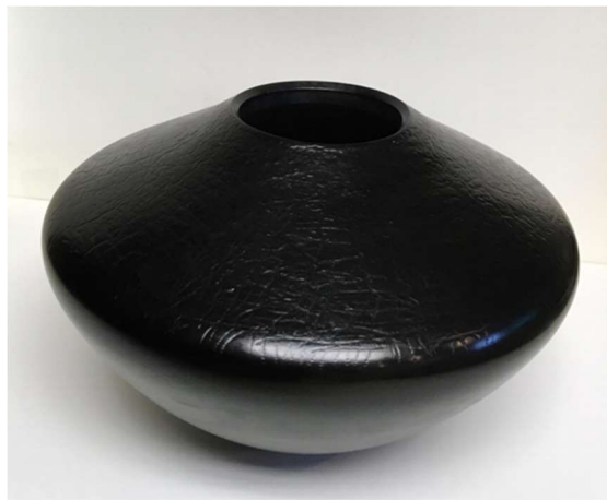
Native American Seed Pot

Pear wood is turned, hollowed, indexed, lines burned, colored and finished