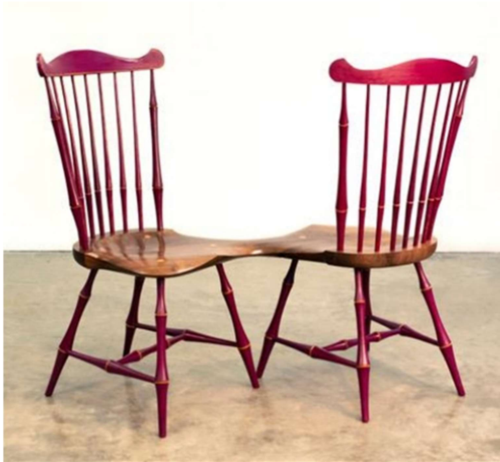
Conversation Chair #2