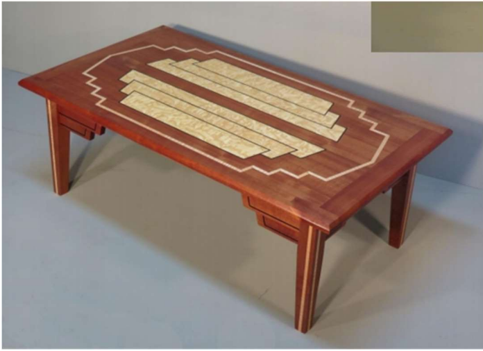
Art Deco Coffee Table

I am a woodworking hobbyist who has enjoyed creating objects from wood most of my adult life. I am self-taught but with the recognition of much learning from the East Tennessee Woodworkers' Guild of which I am a juried member. Most of my efforts are in furniture with a few turned objects and art objects thrown in. Design and the challenge of making the object of my design is the area that interests me most.