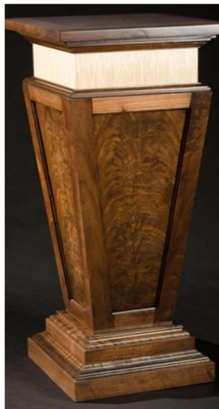
Plant Stand 43 X 17 X 17 Crotch Walnut wood. Domino construction.

Both are Pommele Sapele wood with domino construction.