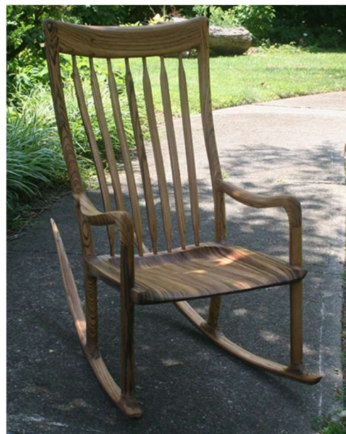
Zebrawood Rocking Chair 41 x 24 x 50 Zebrawood with purpleheart accents