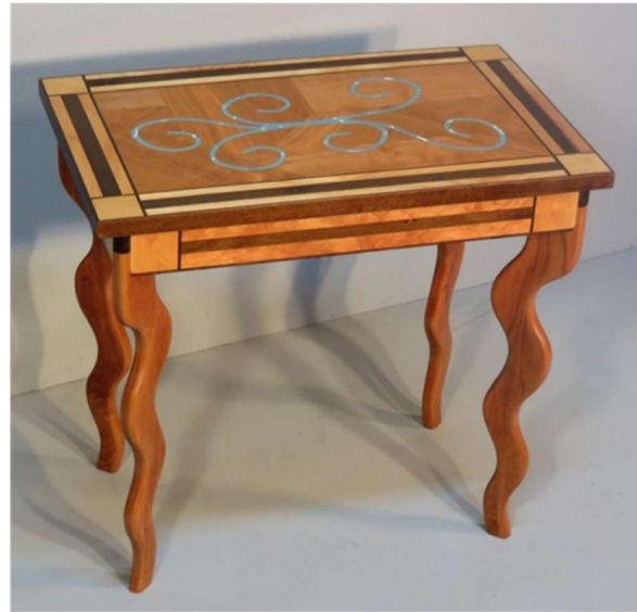
Art Nouveau/Deco Side Table

Design inspired by study of elevator doors. Cherry with oak and maple inlays.