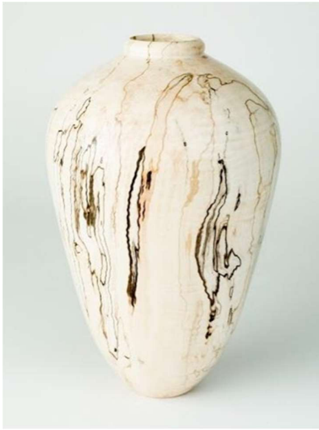
Spalted Maple Vase

I began woodturning 4 years ago and my current work focuses on original designs incorporating carving, color and surface enhancements. I'm a juried member of the East Tennessee Woodworkers Guild