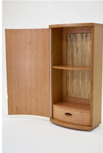
Hanging Wall Cabinet