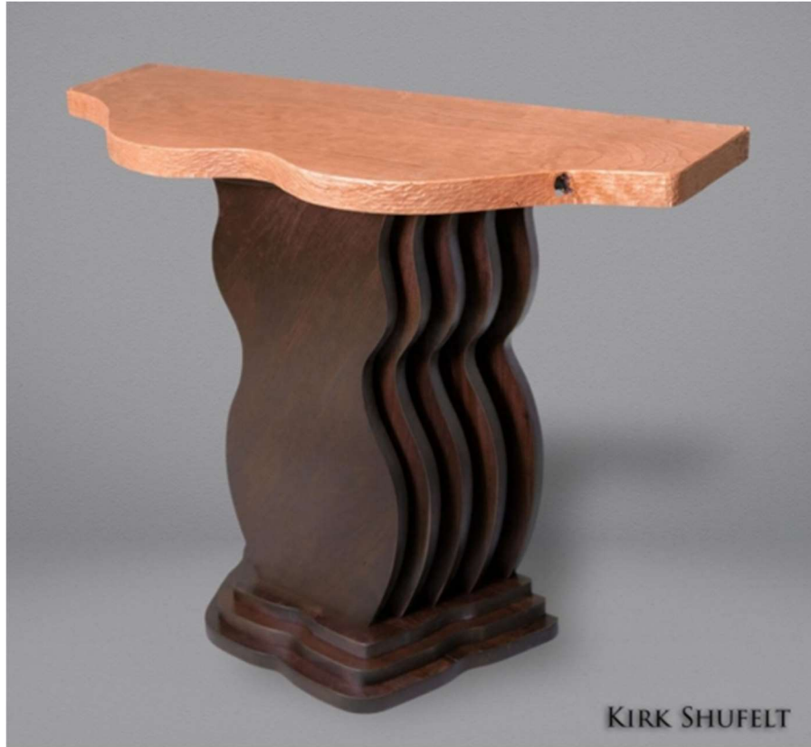
Shape of a woman 32 X 48 X 15 Stained poplar base with cherry top.

I am a professional woodworker building custom cabinets and furniture.