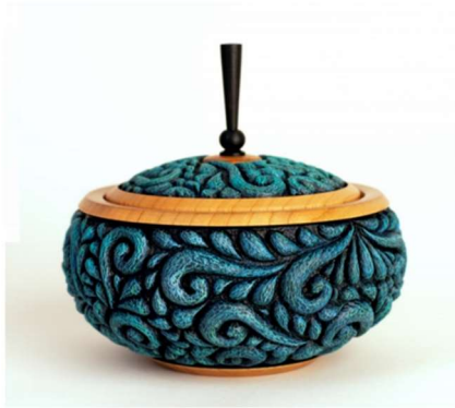
Wind & Rain

I am a passionate and lifelong woodworker and carver. I have exhibited and taught woodworking, woodturning and carving throughout the US and have had artwork or writing published in American Woodturner, More Woodturning, and Woodturning Magazine. I am Deputy Director at Arrowmont School of Arts and Crafts in Gatlinburg, TN.