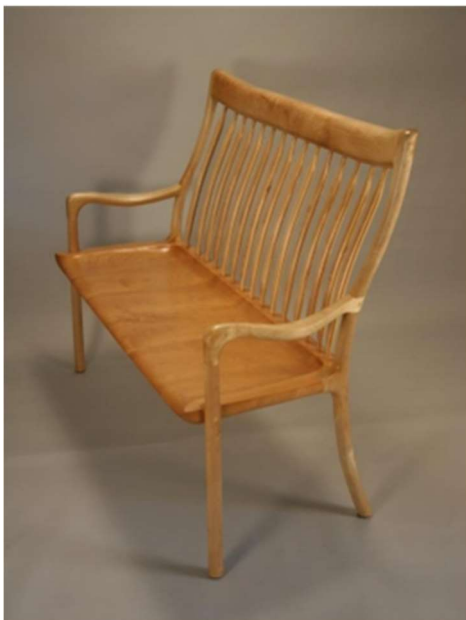
Parsons Bench 40 x 51 x 26 Cherry seat and maple crest, legs and arms