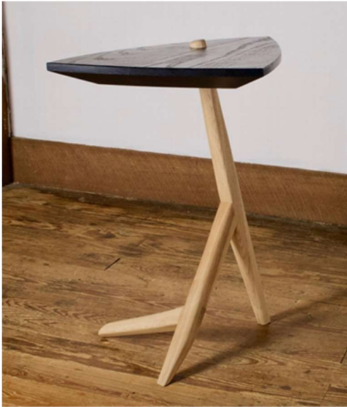
Leaf Side Table

I honed my craft in Boston as a member of Charlestown Furniture Makers. I have been a featured artist at Rala and exhibited with the Tennessee AIA and IIDA chapters and Dogwood Arts. I love problem-solving, old tools, hand-cut joinery and smart design that balances style and function.