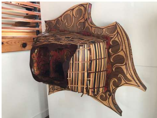
Dragons Lair 38 X 48 X 22