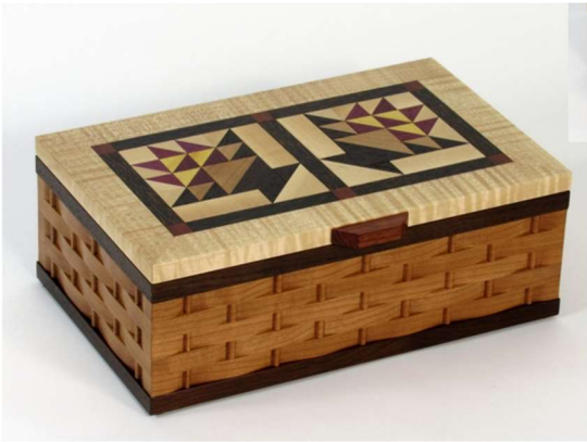
Grape Basket Quilt Pattern Heirloom Box

Since early retirement from engineering, my woodworking has gone from part-time to full-time with a focus on making various jewelry and heirloom boxes. In recent years, I've begun to incorporate quilt patterns into many of my boxes with the body of the box being inspired by the quilt block name. I am a member of the Southern Highland Craft Guild and sell my work through their shops. My boxes have been selected for inclusion in three Best of Tennessee Craft Shows. One of those boxes was purchased by the Tennessee State Museum for its collection.