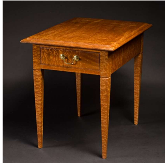
Chippendale Side Table 22 X 18 X 24

Both are Pommele Sapele wood with domino construction.