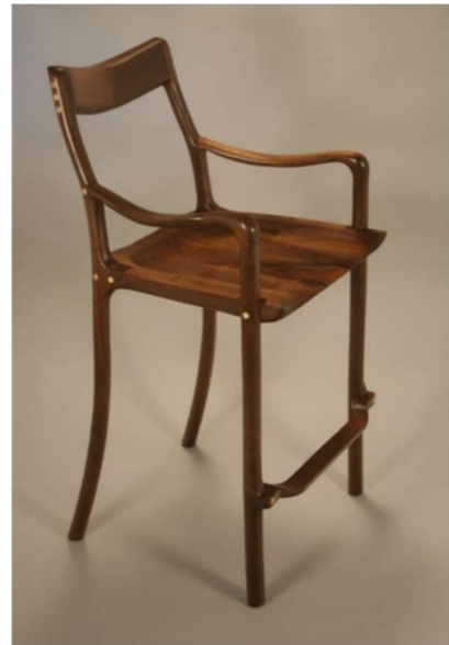
Barstool with Arms 42 x 21.5 x 23 Walnut