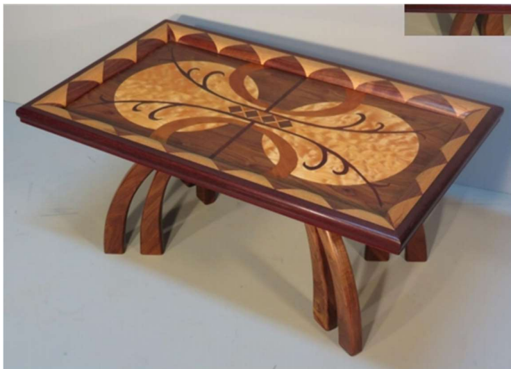
Art Nouveau Coffee Table

Design integrating features of both styles. Cherry with walnut and epoxy inlays.