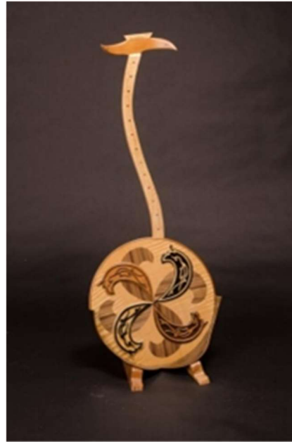
Banjo and Stand 36 X 13 X 8