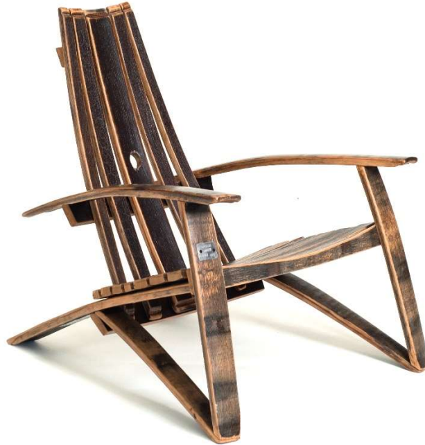
Lounge Chair #489 43"x32"x32"

I have been honing my skills for over 25 years. Doing my part to reduce my footprint on the world, I have been up cycling wine and bourbon barrels into timeless pieces since 2009. My patented lounge chair and full line of artistry is collected throughout the USA and Europe. With well over 1,200 pieces sold, I now look forward to producing more pieces along with my custom works.