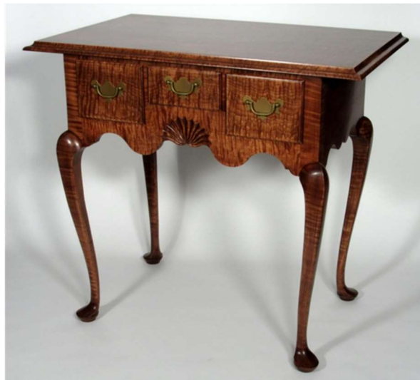
Three Drawer Dressing Table