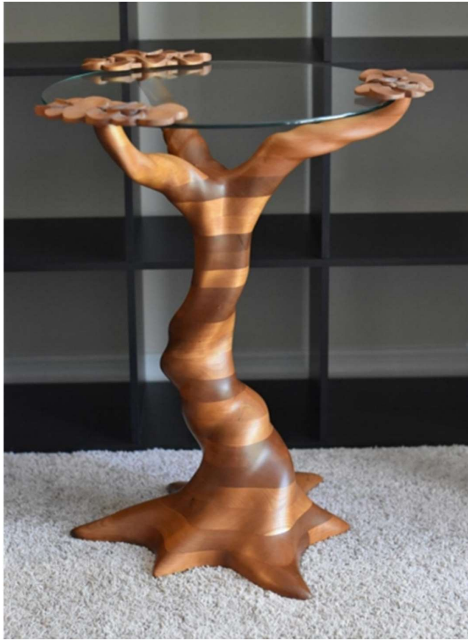
Cherry Blossom II 25 X 21 Dia.

I am a wood sculptor and furniture maker inspired by the natural world from which the material comes. I create free-flowing, organic "tree furniture" and wildly sculptural vessels. My work is found in private collections across the country and abroad, as well as the permanent collection of the Tennessee State Museum.