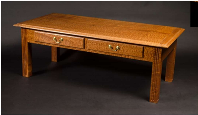
Coffee table 17 X 24 X 50

I'm now 100 and have been building high-end furniture for 85 years. I specialize in period furniture of the Chippendale, Hepplewhite and Sheraton designs. I also build pieces of my own design and others which attract my fancy. My goal has always been to produce quality furniture of uncompromising craftsmanship with finishes that beg to be touched.