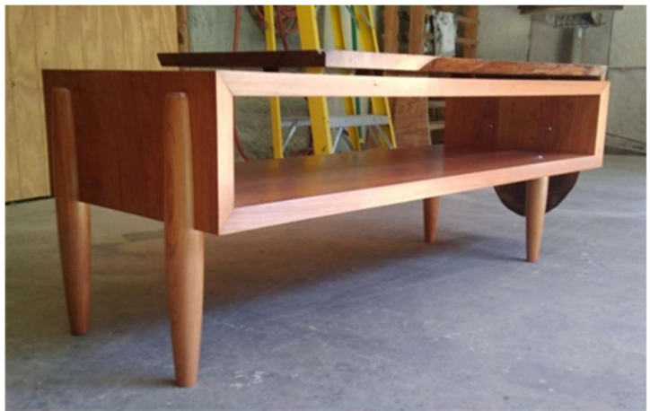
Pair of Coffee Tables