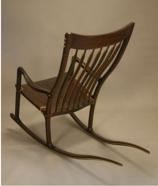
Wenge Rocking Chair 41 x 24 x 50 Wenge with Pau Amarillo highlights

I am a furniture designer who has enjoyed crafting unique works with an artistic and functional significance. My designs are influenced by the Danish Modern era and use decorative wood types and signature crafting methods to achieve an essence that is Bradford Custom Furniture.