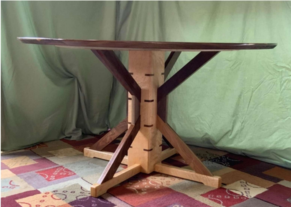
Dining table 30"x53" diameter

Woodworking is not only my hobby; it is my passion! I'm inspired by all things wood! From selecting just the right type of wood for a project — to creating the perfect design — I am in my "happy zone." Known for my eclectic taste, I work diligently to become a better craftsman. From custom tables and furniture made for my family to one-of-a-kind jewelry boxes, I allow the creative juices to flow. Seeing the expressions on the recipients of my work make it all worthwhile!