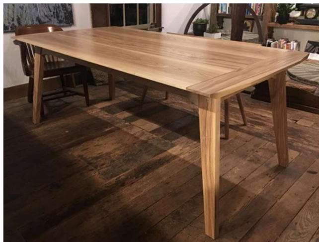
Riverdale Dining Table

White Ash. Clear topcoat, black stain. Legs fold to change height. Angled lap jointed base